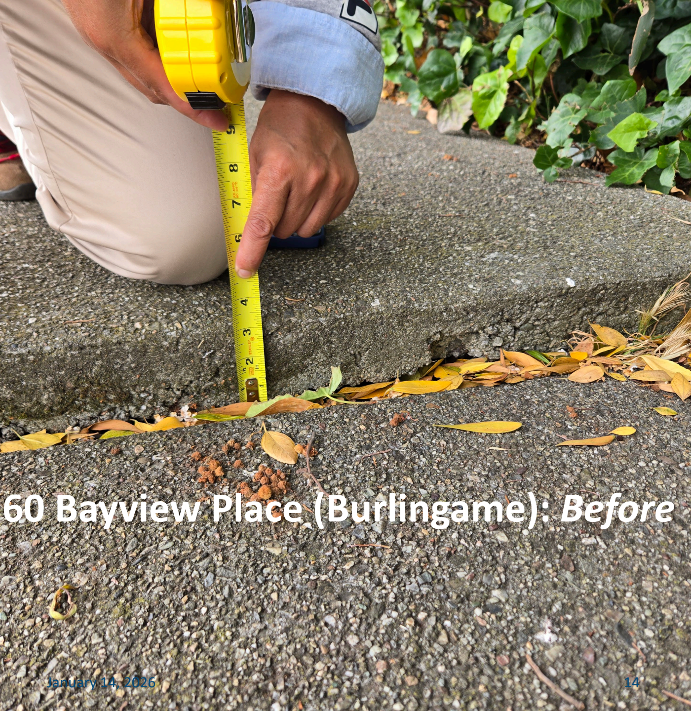
60 Bayview Place (Burlingame): Before