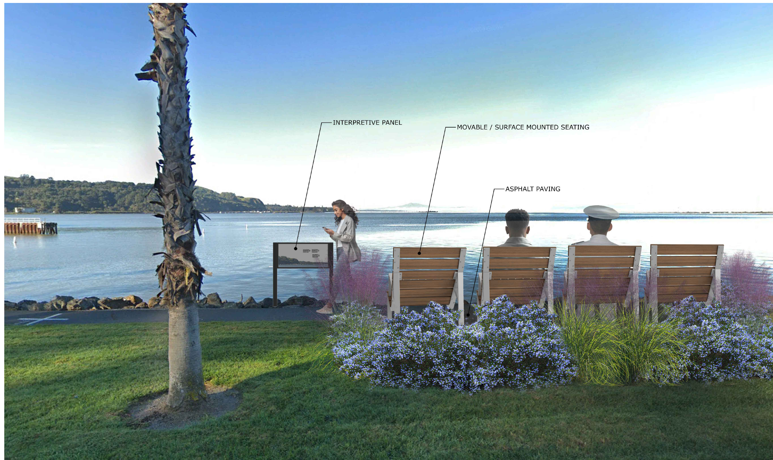
Figure 1B. CAL MARITIME PUBLIC VIEWING AREA - CONTRA COSTA

PUBLIC VIEWING AND OUTDOOR LIVING AREA EMPHASIZING HISTORY OF THE SHORELINE/CARQUINEZ STRAIT. INCLUDING ONE INTERPRETATIVE EXHIBIT AND MOVEABLE OUTDOOR SEATING FOR FOUR PEOPLE BORDERED BY BAY-FRIENDLY PLANTINGS.