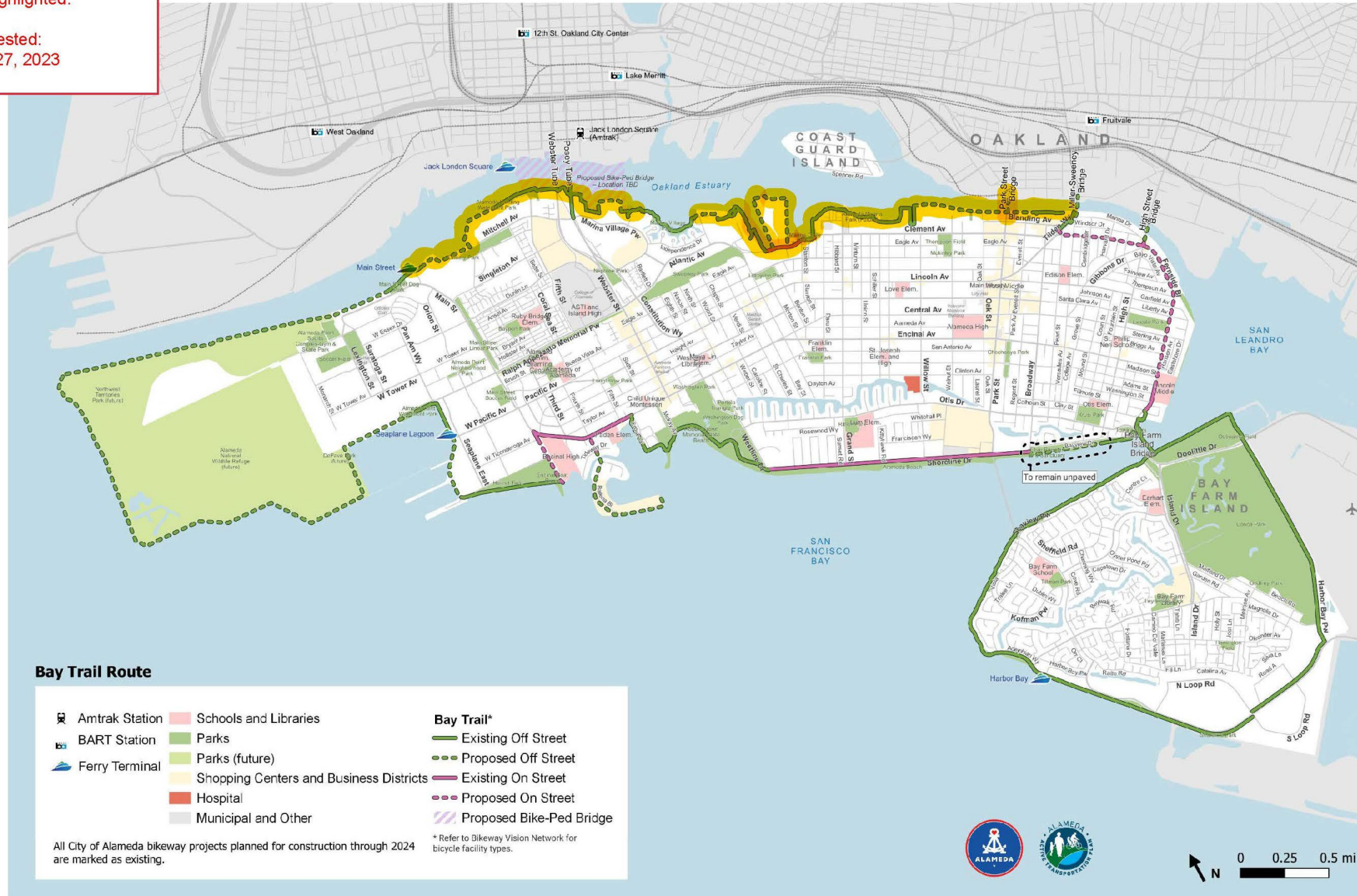
Figure 9. Bay Trail Route